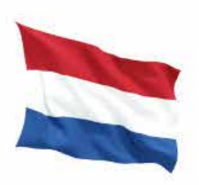
Nederlandse Vereniging voor Credit Management (VVCM)