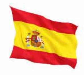
Asociación de Gerentes de Crédito AGC